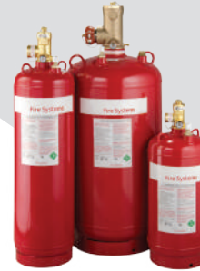
Optional Fire Suppression