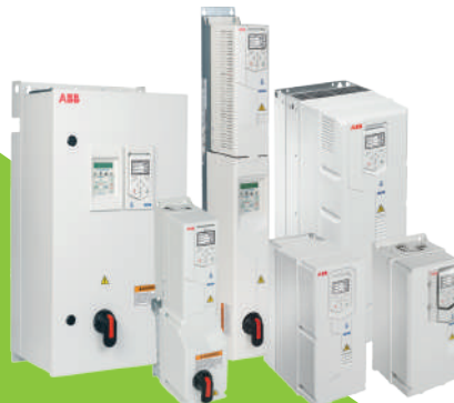
Variable Speed Drives: Automatically increases the fan speed to purge rising LEL Gases or Solvents