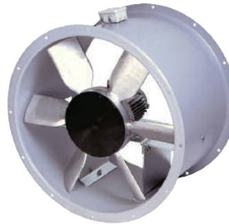
High Velocity fan with non sparking blades