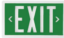
Self Luminating Exit