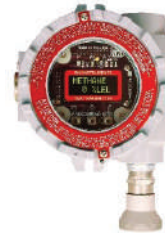
LEL Gas Detector: Butane, CO2, Ethanol