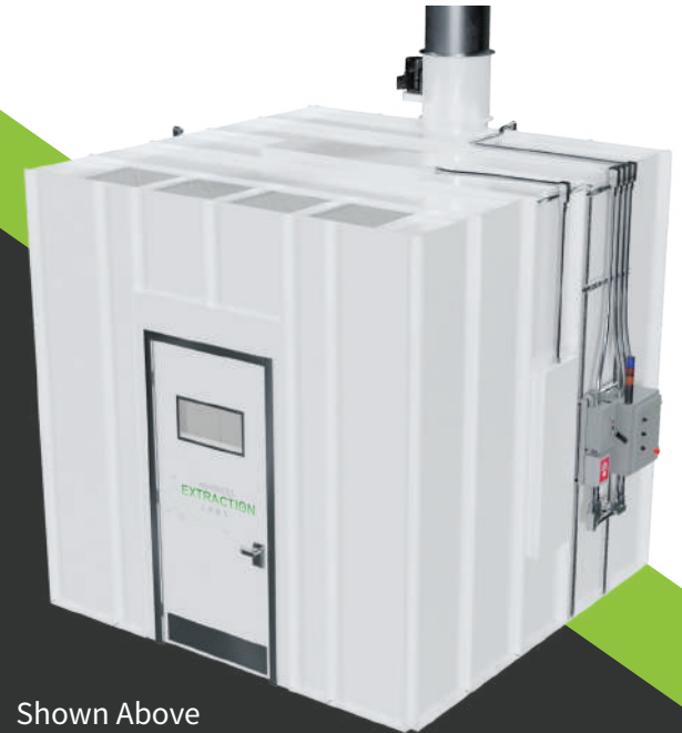
Shown Above (Mega Economy Series)