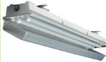
C1D1 or C1D2 Lighting